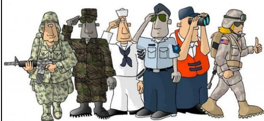
Military Humor highlights is from the Facebook group by the same name