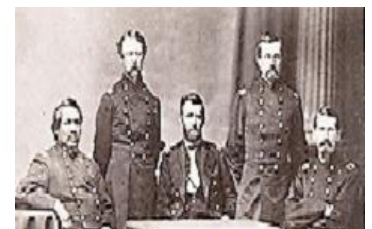
Ely Parker (L), Ulysses S. Grant (at table)

When the Civil War starts, he attempted to raise a company of Iroquois volunteers, but the Governor turned him down. He attempted to join the Union Army as an Engineer, but the Secretary of War said "No" because he was an Indian. He contacted a friend, Ulysses S. Grant who needed Engineers. Parker was commissioned in May 1863 as a Captain. He served at the battels of Vicksburg, Chattanooga, Overland Campaign, Siege of Petersburg and Appomattox. Parker was later appointed as an Adjutant to Grant and later became his personal secretary. Parker was at the surrender of Robert E. Lee in April 1865 and wrote the surrender documents for Grant. Parker was by then a Brevetted Brigadier General of the United States Army.